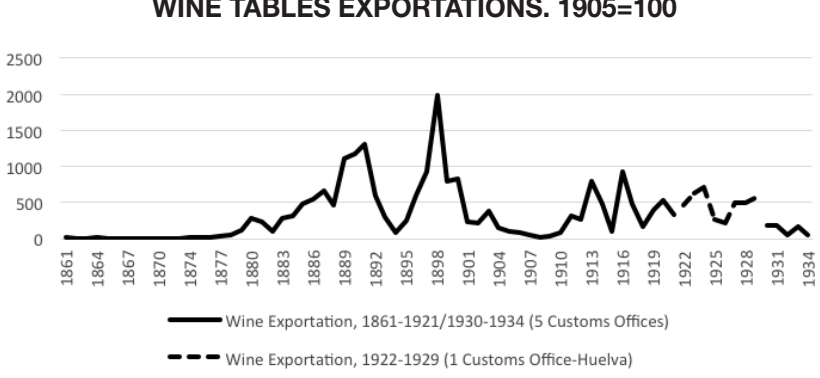
FIGURE 1 WINE TABLES EXPORTATIONS. 1905=100

25,212,964 HI left the Port of Huelva by cabotage, respectively. Eustaquio Jiménez, tried to market his products in the American market and it was a failure. Nevertheless the recovery experienced in the sector during the 20th century, the volumes achieved in the last years of the 19th century were never reached again.